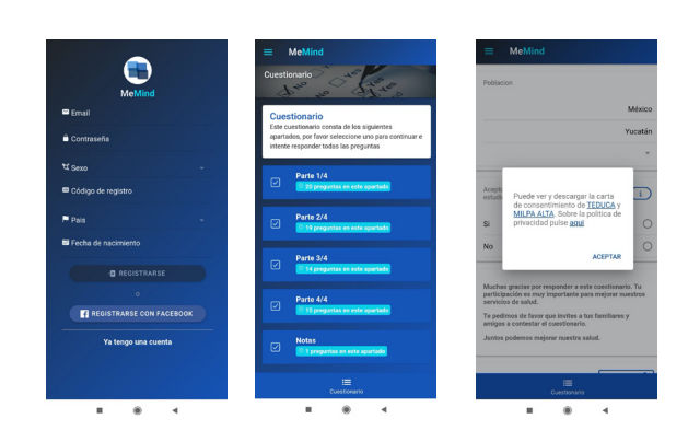
Figure 2 MeMind screenshots.