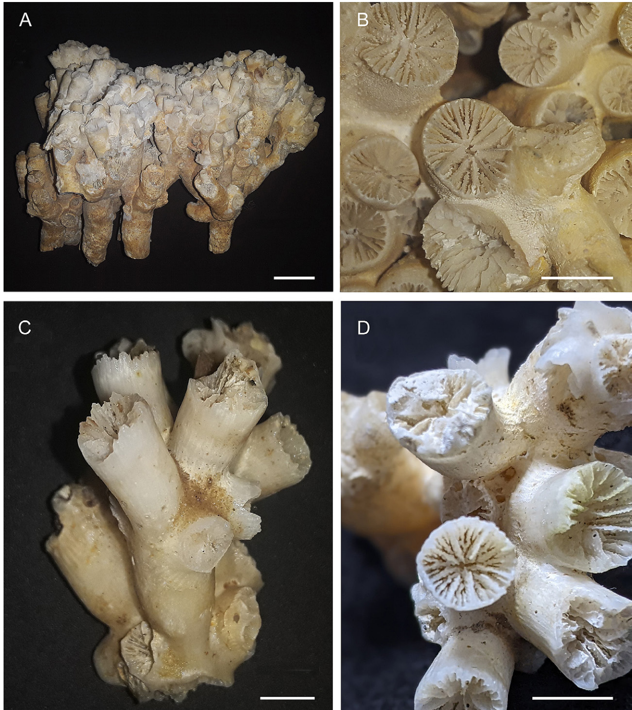
Figure 1. Distribution of Coenocyathus bowersi along the Pacific coast of America showing previously known and new records reported here. A. Distribution in the Northern Hemisphere based on Cairns (1994). B. Chilean occurrences of the species: green icons = Caldera (reported by Araya et al. 2016); red icons = new records at Iquique and Taltal (present study).

New records. CHILE – ANTOFAGASTA REGION • Taltal, Pelao Sáez sector; 25°38'42"S, 070°38'35"W; 42 m depth; 12.VII.2013; F. Méndez-Abarca leg; collected manually from rocky substrate; 1 specimen (Vida Salvaje - Museo Vivo, COLECNI0149FRA) – TARAPACÁ REGION • 12 km south of Iquique; 20°12'51"S, 70°09'09"W; 32 m depth; 26.II.2014; F. Méndez-Abarca leg.; collected manually from sandstone substrate; 1 specimen (Vida Salvaje - Museo Vivo COLECNI0150FRA).